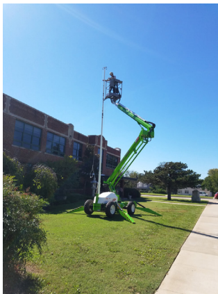
Friends working during the first work day of Project #2